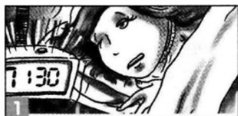
1 every day / get up / at half past seven