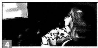
4 once a week / watch a film at the cinema