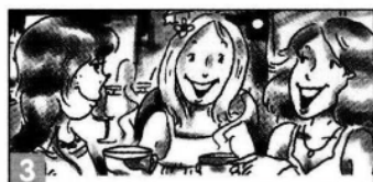
3 in the evening / usually / meet her friends for coffee