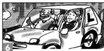
6 have a driving lesson / twice a week