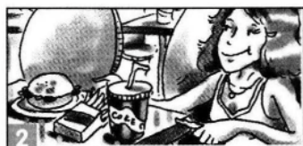
2 often / eat fast food for lunch