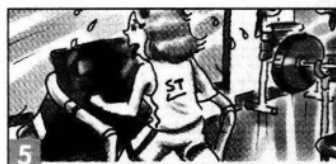
5 rarely / go to the gym